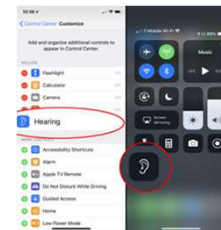
Apple Live Listen