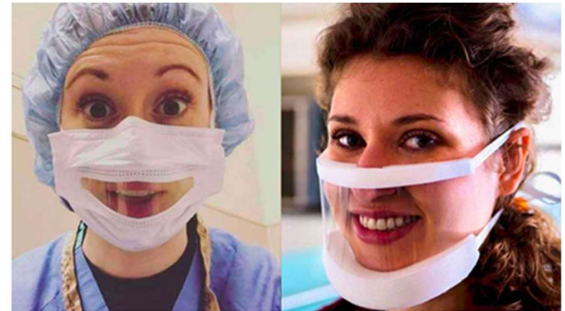
Communicator Mask FDA Approved